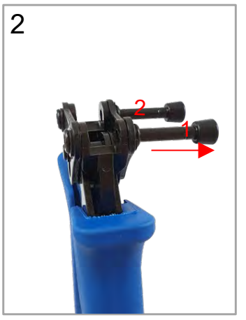
Extract the pins.