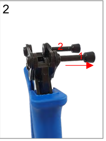
Extract the pins.