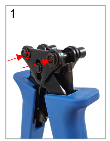
Unlock 2 pins by pushing towards them.