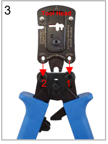
Open the handles and insert the tool head into the open holes.

The laser marking of both parts should match.