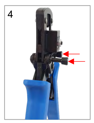
Lock the pins by pushing toward them. Hand Tool is ready to use.

The laser marking of both parts should match.