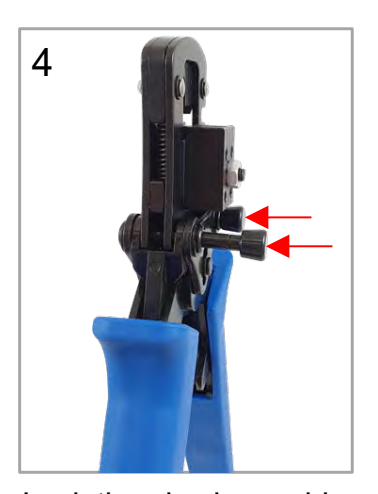
Lock the pins by pushing toward them. Hand Tool is ready to use.