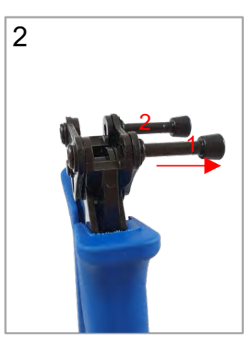
Extract the pins.