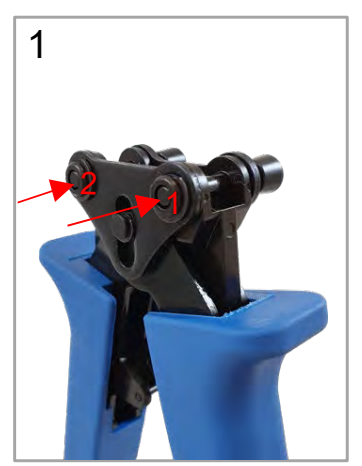
Unlock 2 pins by pushing towards them.