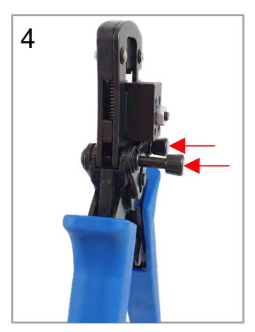
Lock the pins by pushing toward them. Hand Tool is ready to use.