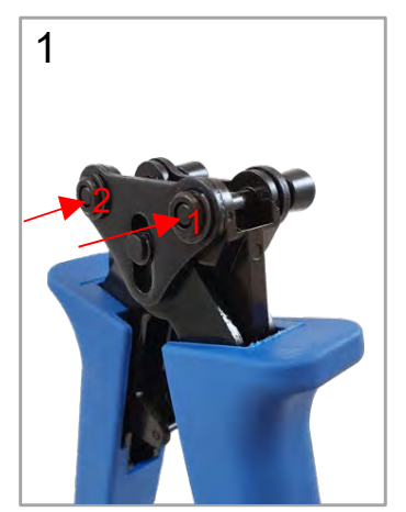
Unlock 2 pins by pushing towards them.