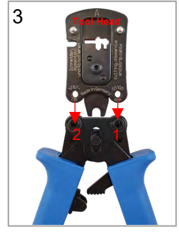
Open the handles and insert the tool head into the open holes. The laser marking of