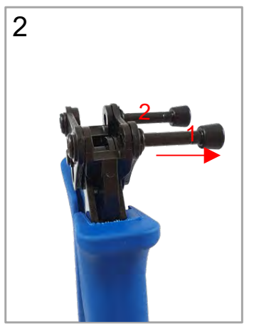
Extract the pins.