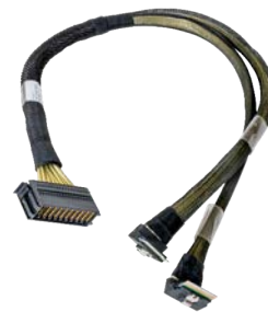
Cable Option – Internal Connection